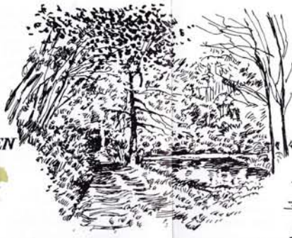
The Waterflash floods the ancient trackway which crosses east-west over Oldbury Hill. A prehistoric track from Pevensey to the North Downs once passed nearby.