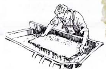
Paper mill workers are recorded in the census returns of villages along the northern reaches of the Bourne. Paper mill pollution led to local cottage interiors being lime-washed with colourful "Roughway Blue".