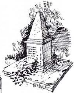
30 drowned hop-pickers are commemorated on this monument in St. Mary's churchyard, Hadlow. (See annotation in the church porch).