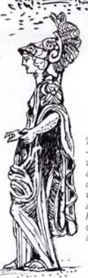
This statue of Minerva - Roman goddess of wisdom, patron of arts and crafts, protectress of agriculture and a warrior - was found at Allen's Farm, near Plaxtol. She may have originally held a spear and shield.