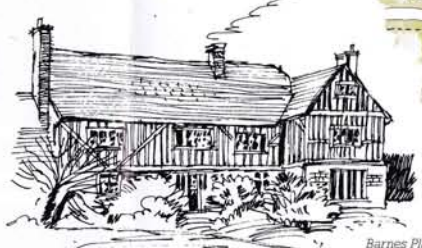
Barnes Place, listed Grade 1, is the oldest surviving house in Hadlow parish.